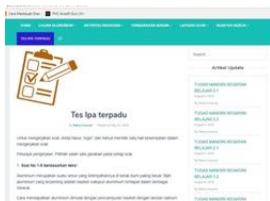
Picture 2. Test evaluation based digital module